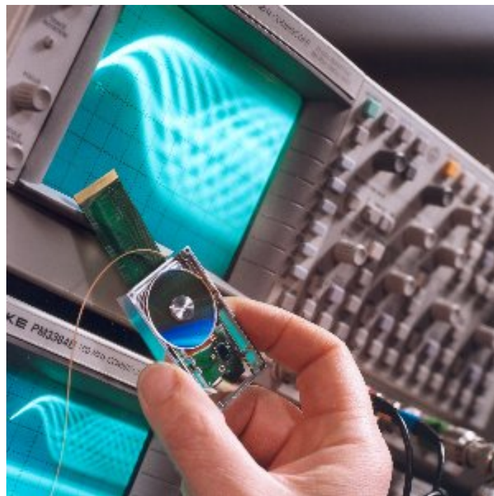
Figure Z1-2 Philips prototype blue micro-optical disc system.